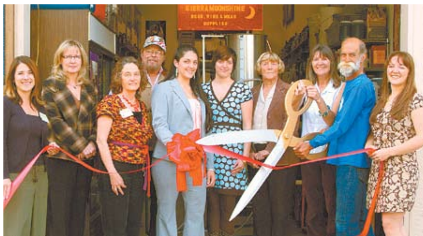
Sierra Moonshine Ribbon Cutting Wine & Beer Supplies